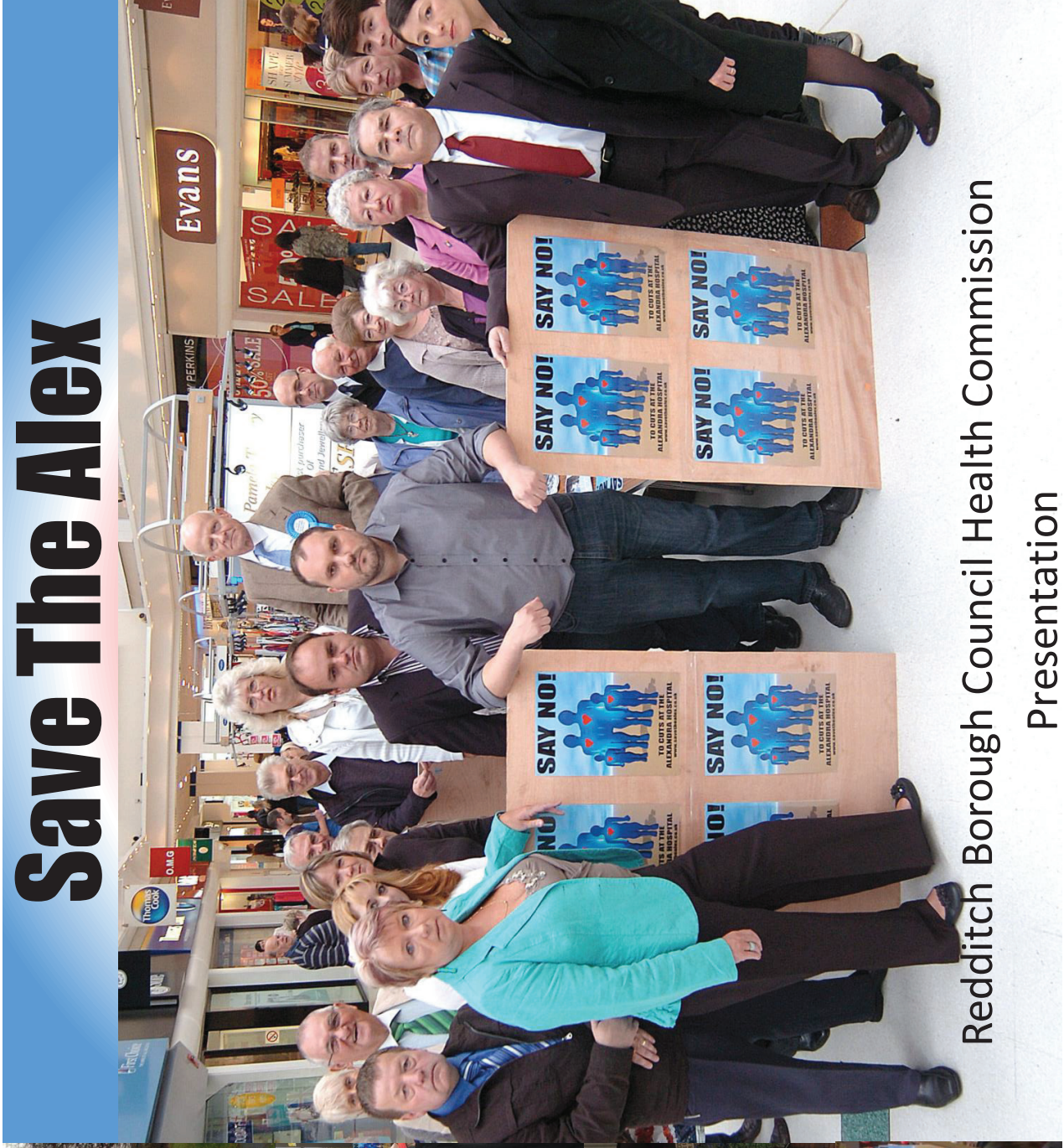
Redditch Borough Council Health Commission Presentation